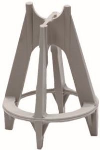
Used for Chair Sizes for 3-1/4" to 6" Cover Height.