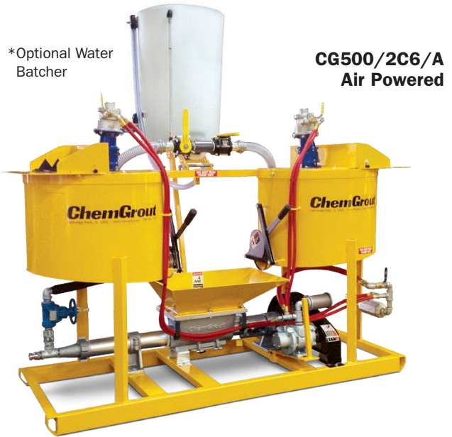
*Optional Water Batcher

Soil compaction, rock grouting, void-filling, waterproofing, soil anchors, cable bolts, rock bolts, well encasements, contact grouting, well abandonment, marine/underwater, post tensioning, precast, machine base installation, self-leveling floor underlayments, slab undersealing and slabjacking.