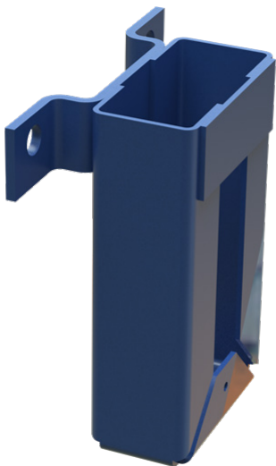
C-52 Bridge Overhang Guard Rail Receptacle

The C52 Guardrail Receptacle is designed to facilitate placement of guardrail posts on the exterior formwork. The C52 receptacle bolts securely to the C54 Bridge Overhang Bracket Extender and accepts 2x4 guardrail posts.