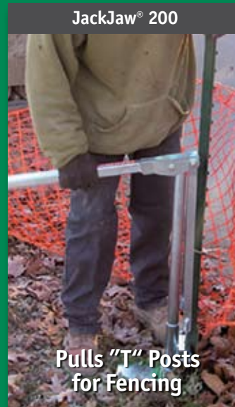
Pulls "T" Posts for Fencing

"The best stake puller I have ever used."