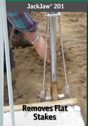
Removes Flat Stakes