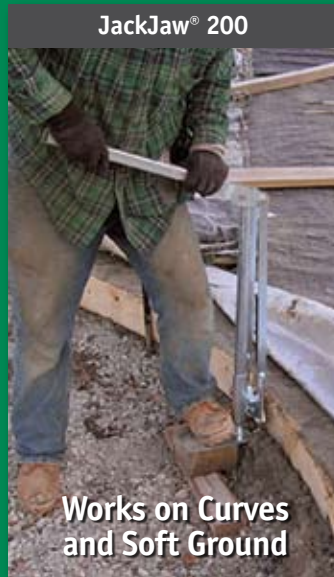
Works on Curves and Soft Ground