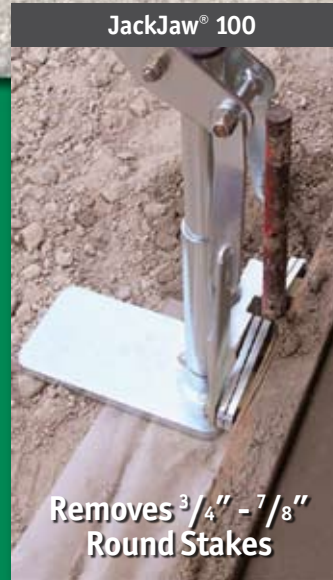
Removes 3/4" - 7/8" Round Stakes