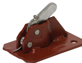
Quick Rod Clamp